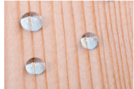
Treated with SILRES® WH