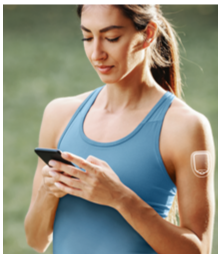
SILPURAN® silicone adhesives allow for secure fixation and gentle repositioning of wearable technology.