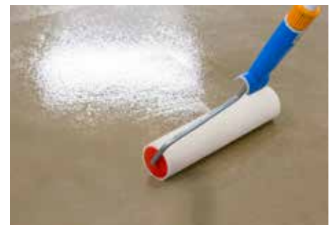
Coatings based on SILRES® BS 6920 are easily applied by wiping or rolling.

Impregnating agents based on SILRES® BS 6920 are usually applied twice. The first coat strengthens the floor. A second produces a homogeneous surface that increases scratch and scrub resistance and makes the floor polishable. It is possible to walk on or drive over the floors about twenty-four hours after treatment.