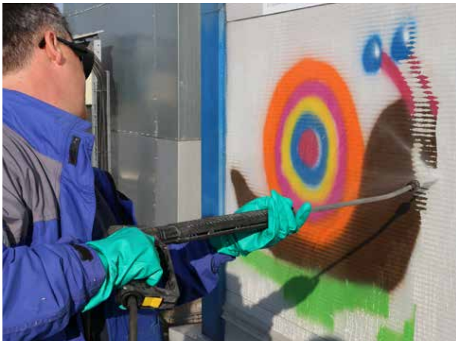
Removal of graffiti: Larger graffiti can also be easily removed using a high pressure cleaner with cold water.

Clear and pigmented coatings with matt or glossy surface finish. Flexible in dilution with organic solvents offers tailor made products.