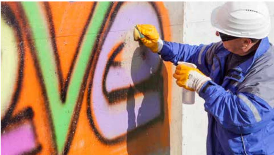
Removal of graffiti: Poor adhesion of graffiti paints on surfaces treated with SILRES® BS 710. Paints can be removed easily with a wet tissue or sponge.

Thanks to SILRES® BS 710's strong adhesive film, tags, spray paints and posters lose their staying power and can easily be cleaned off. The protection is permanent: this means there is no need to reapply SILRES® BS 710 once graffiti has been removed.