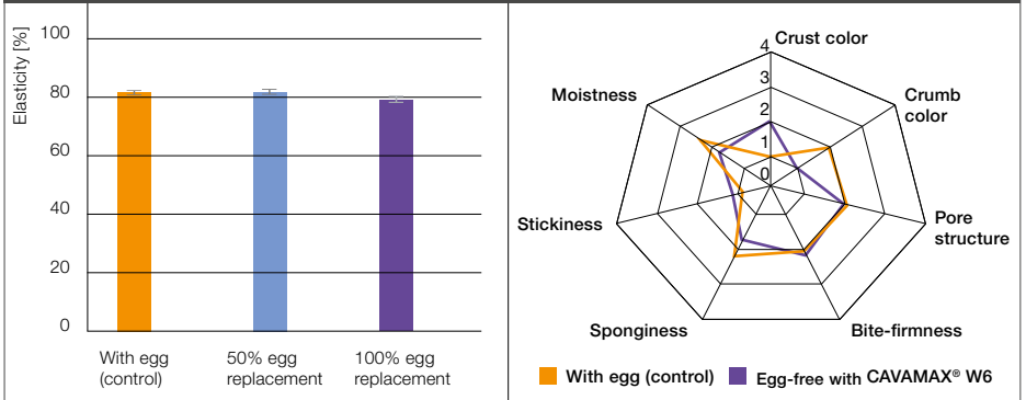
Figure 3: Texture and Sensory Profile of Egg-Free Cake with CAVAMAX® W6 vs. Control

Left: Elasticity of pound cake crumb measured via texture profile analysis. Cakes with partial (50%) and 100% egg replacement contain 1% CAVAMAX® W6; the protein and water content have been adjusted accordingly.