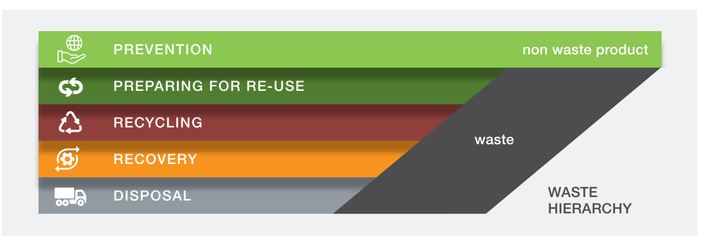
Figure 1: Waste hierarchy