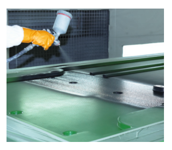
3.2 Coloring of the plate