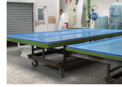
Simultaneous serial production: the molded parts are made on three tables at the same time.

Large number of reproductions: the bags (approx. 4 x 3 m) can be rolled up for transportation and used again and again. This bag has already been used 250 times.