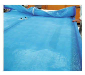
2.2 Covering the fibered mold with reusable vacuum bag