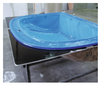
1.4 Spraying the final layer