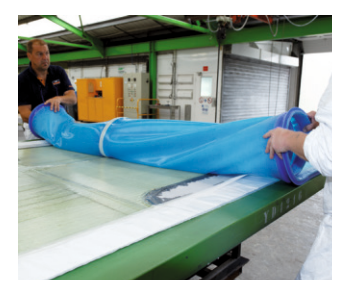
3.1 Removal of bag after curing (2 hours)