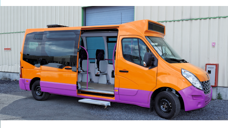
The French company Durisotti uses vacuum-bag technology to make floor panels for commercial vehicles. Composite floor panels are ten times lighter than conventional ones and exhibit the same stability.