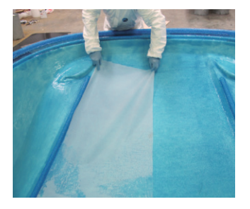
1.3 Applying the fabric