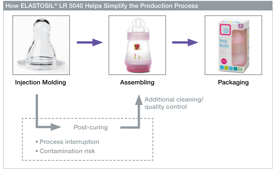
The process steps shown in gray are obsolete when ELASTOSIL® LR 5040 is used