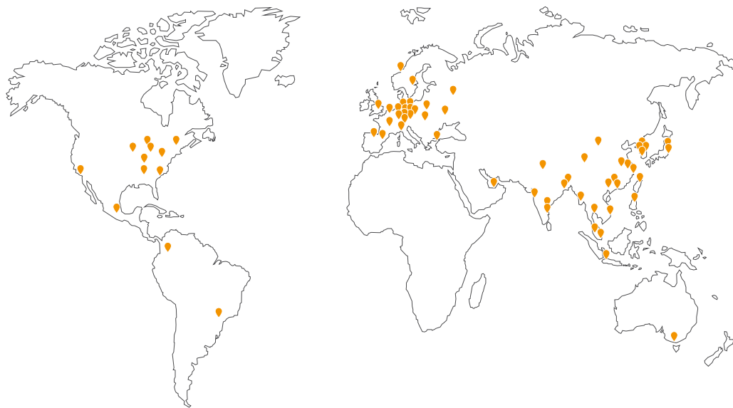
◆ Sales offices, production sites and technical competence centers around the world.

WACKER is one of the world's leading and most research-intensive chemical companies, with total sales of €4.98 billion. Products range from silicones, binders and polymer additives for diverse industrial sectors to bioengineered pharmaceutical actives and hyperpure silicon for semiconductor and solar applications. As a technology leader focusing on sustainability, WACKER promotes products and ideas that offer a high value-added potential to ensure that current and future generations enjoy a better quality of life, based on energy efficiency and protection of the climate and environment. Spanning the globe with 4 business divisions, we offer our customers highly-specialized products and comprehensive service via 24 production sites, 22 technical competence centers, 13 WACKER ACADEMY training centers and 50 sales offices in Europe, North and South America, and Asia – including a presence in China.