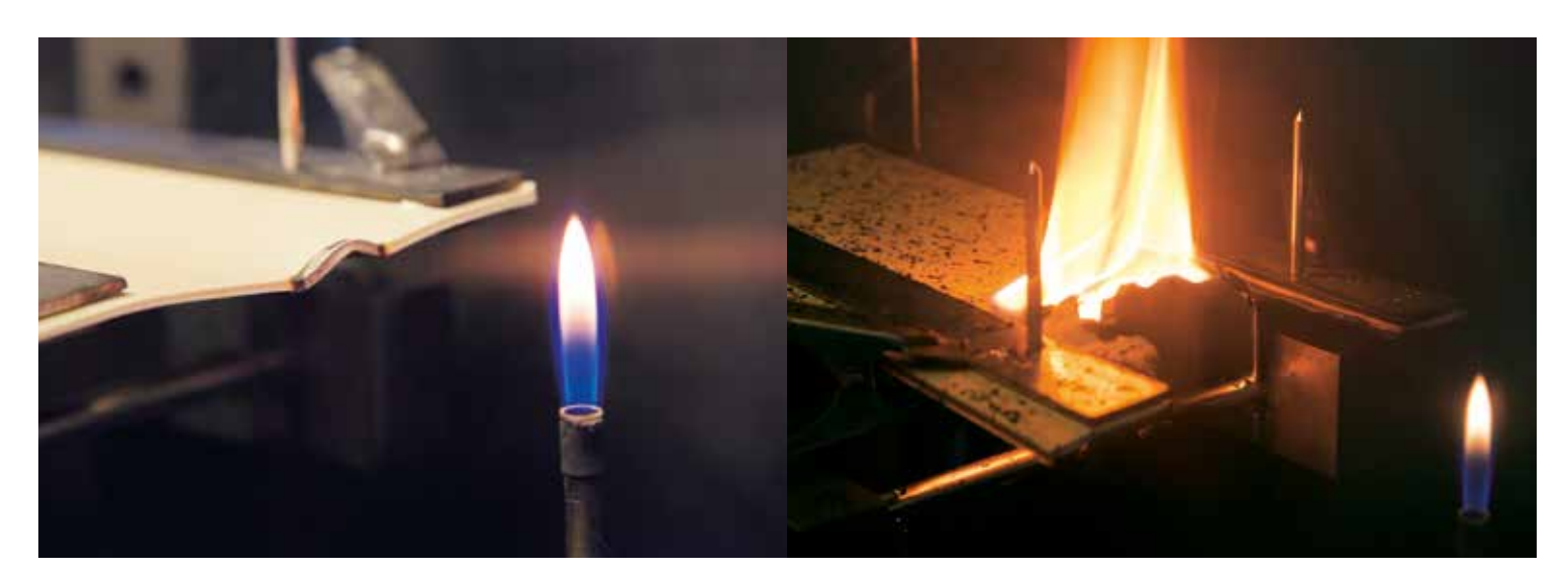
VAE/calcium carbonate film (150% filler loading according to DIN 4102-1; self-extinguishing.