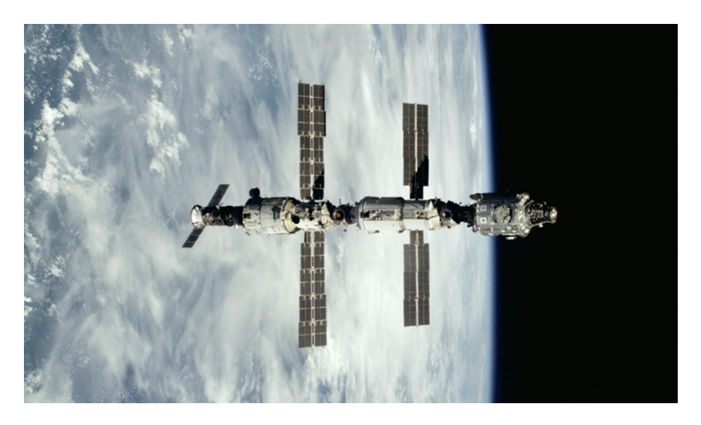
\mathsf{WACKER}^{\$} and \mathsf{ELASTOSIL}^{\$} are registered trademarks of Wacker Chemie AG.

WACKER® RTV-S 691 can be applied by any conventional coating method such as dispensing, knife coating, transfer roller coating, screen printing, etc.