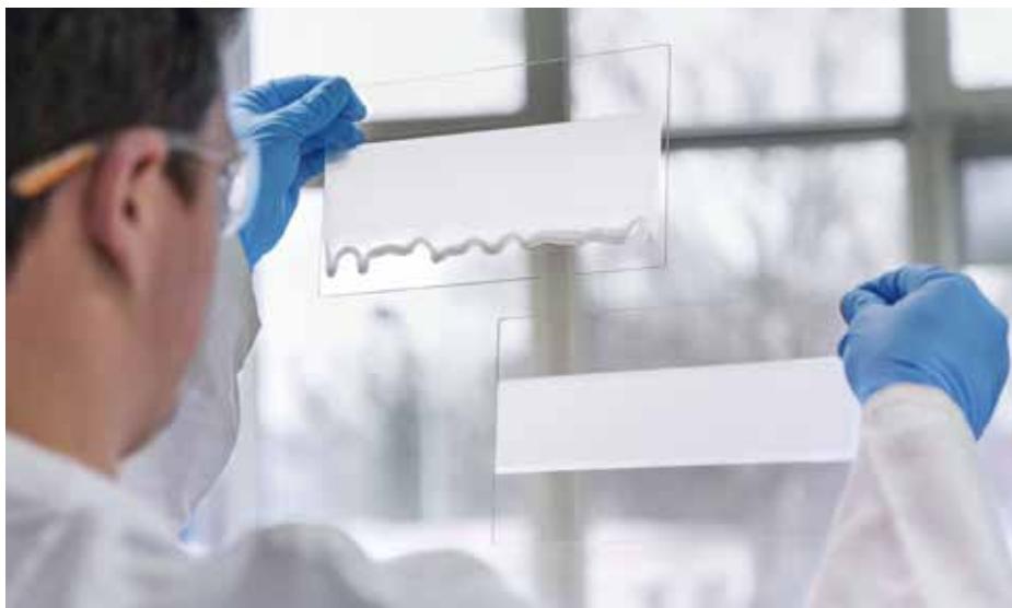
HDK® H21 provides optimal sag resistance in many resin systems.

For more information visit: www.wacker.com/hdk