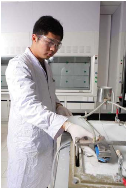
WACKER Shanghai Technical Center: Testing scrub resistance of a novel environmentally-friendly interior paint based on WACKER VAE dispersions in the new polymer dispersion lab.