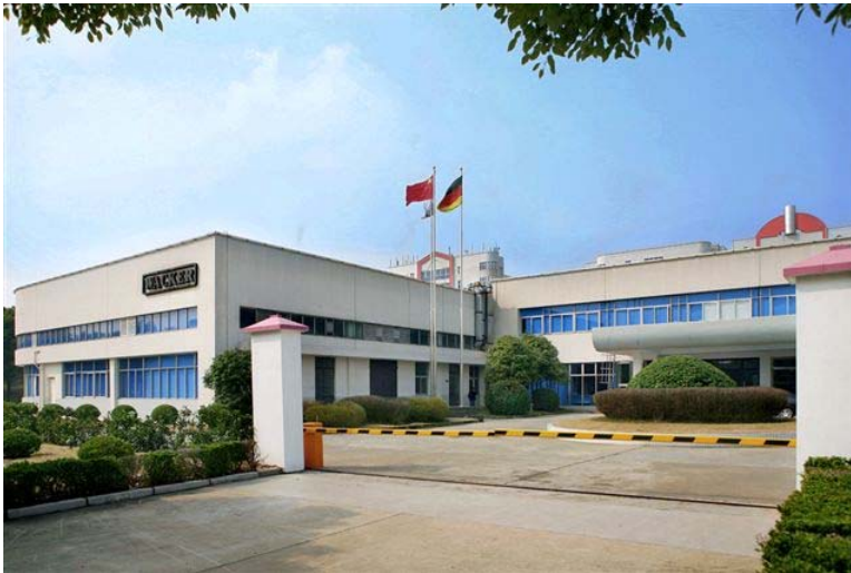
The new Technical Center in Shanghai significantly boosts WACKER's local R&D competency and optimal customer support to Chinese market.