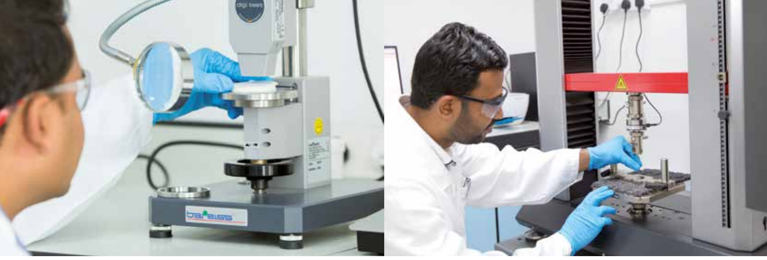
Under the brand name ELASTOSIL®, WACKER offers a broad range of silicone elastomers' products.